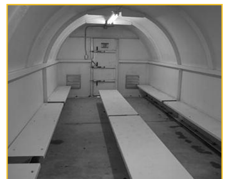
Walker County Commission Storm Shelters

Youth Advocate Program, Inc.: To help continue the successful collaborative Truancy Prevention/Intervention Initiative.