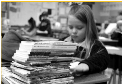
Grand Prize Photograph

In 2015, the contest will feature photographs made in April (exact dates TBD) and the exhibit will be August 4-October 16. So, get your cameras ready to participate next year!