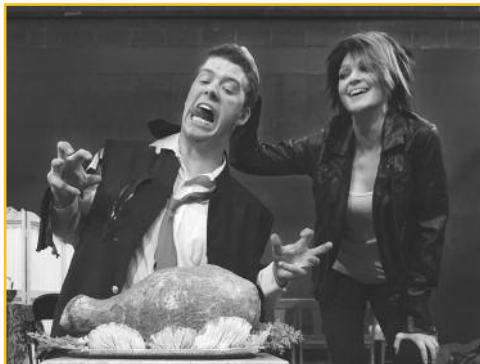
Taming of the Shrew

UAB Theater presented 16 performances in the 2013-2014 academic year in elementary, middle and high schools in Walker County.