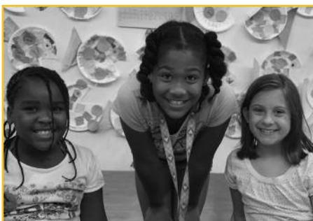
Girls, Inc. Summer Program

The Barbara Drummond Thorne Fund, given by her estate, offers financial aid to the organizations that were closest to her heart. The Barbara Drummond Thorne Fund awarded $64,639 in grant money for the following project: