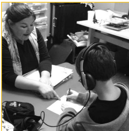
Autism testing - ARC of Walker County

Walker County Commission: To provide the matching dollars for the Sipsey storm shelter to be built.