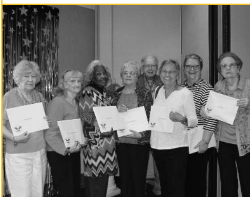
Positive Maturity Presidential Lifetime Achievement Award for Volunteer Service

Walker County Commission: To provide the matching dollars for the Parrish, Argo and Eldridge storm shelters to be built.