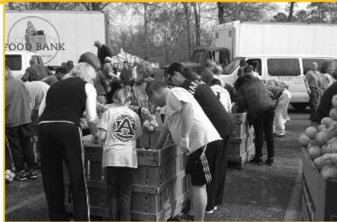
Volunteers Bagging Apples for the Community Food Bank of Central Alabama

Jasper City Schools: Transportation costs for buses to bring students to tour the Bankhead House & Heritage Center.