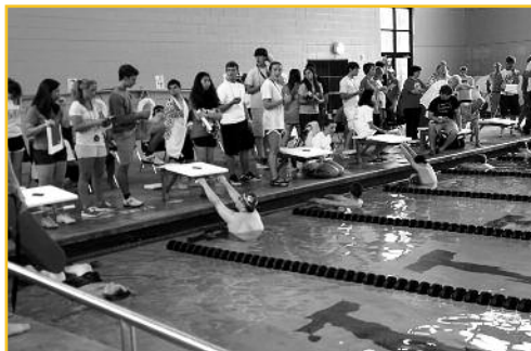
Jasper Aquanauts Special Olympics Sectional Swim Meet

Jasper Housing Authority: To fund the Jasper Housing Authority Summer Youth Development Camp and After School Program.