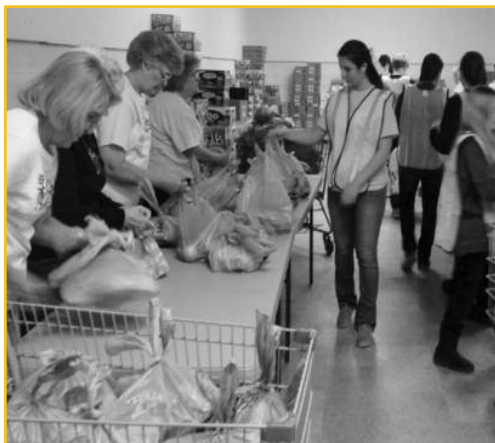
Volunteers packing bags

At the end of the 2013 school year, Backyard Blessings had packed 13,283 bags of food and sent them home with their children. BYB works to feed school children so they will not be hungry on the weekends!