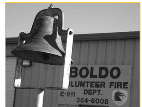
Boldo Volunteer Fire and Rescue