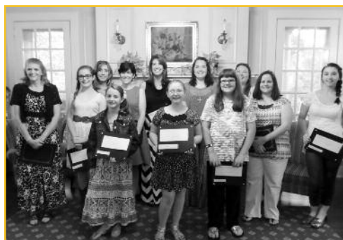
Winners Attending Opening Reception